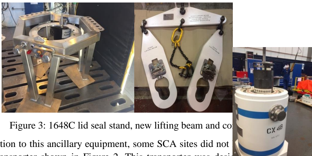
Figure 3: 1648C lid seal stand, new lifting beam and container.

Operation of the package therefore needed to be cognisant of the operational restrictions imposed by the SCA sites and also the receipt facility with respect to the content, whilst maintaining compliance with the PDSR. As well as operational handling, content loading and dispatch processes at the SCAs, 1648C inspections would also need to be considered. For example, a need to replace the 1648C lid containment seals prior to shipment requires an ability to safely handle and manipulate the circa 400kg package lid. After consideration of the SCA facilities and equipment, a number of new items were designed and manufactured by INS to enable 1648C operations. These included a new package lifting beam that could interface with fork-lift trucks, tooling to handle the contents and the lid seal inspection stand.