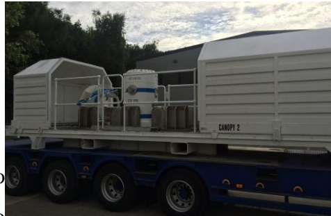
Figure 2: Remotely operated loader and road transporter.

An identified re-use of the 1648C was to transport material from a number of the UK's Source Collection Agency (SCA) sites to a final storage facility at Sellafield. The SCA companies operate from small industrial units and do not have the types of equipment e.g. manipulators, overhead cranes or shielded cell facilities the package interfaced with at Chapelcross. The SCA's perform a critical role in support of operations within the UK's National Health Service (NHS) and the loss of access to existing storage facilities meant alternative storage needed to be identified. The Sellafield store used for the original 1648C content could accept the new waste stream, which removed issues with the package/plant interface during receipt. However, it would place specific conditions on the SCA content, which are further discussed in §1.3.