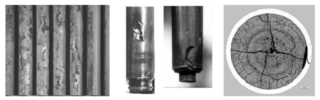
Fig. 1. Failures examples - crud caused corrosion, debris fretting, PCI with SCC from [6]

During reactor operation defects or damage on SNF rods can occur due to reactivity events, debris or handling. Moreover different mechanisms lead to fuel rod failures, e.g. fretting, crud corrosion, pellet cladding interactions, stress corrosion cracking, debris, mishandling, fabrication failure or baffle jetting (Figure 1). All of these rods with the damage mentioned are grouped as damaged spent nuclear fuel (DSNF). The IAEA technical report NF-T-2.1 [6] is engaging intensively with this issue.