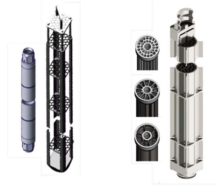
Fig. 2. Examples: Single rod system from AREVA [8] and multi rod system from GNS [9]

Furthermore the IAEA technical report NF-T-3.6 [7] presents management procedures of DSNF from over 20 countries. To ensure safety and to protect persons, property and the environment from the effects of radiation a tight encapsulation of DSNF is a regulatory requirement in Germany [5]. For these large numbers of DSNF new encapsulation concepts for the transport of DSNF in common packages were necessary.