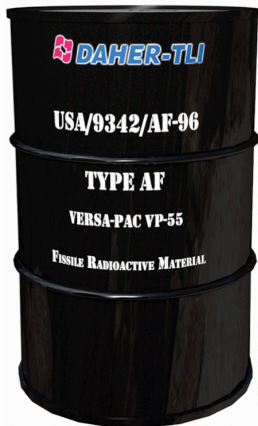
Figure 1 – The Versa-Pac Package

The Versa-Pac is a package that can be used to store, transport, or dispose of any uranium compound at any U-235 enrichment. The Versa-Pac packaging design meets all USDOT [1] , USNRC [2] , and IAEA [3] regulatory requirements of a Type AF package. All design and licensing efforts for the Versa-Pac are aimed at providing a familiar, simple-to-use packaging that is versatile enough to meet customers' current and future needs. The drum style design of the Versa-Pac makes operations and handling of the package similar to the routine operations at any facility. The lack of content restrictions on allowable uranium compounds and wide range of allowable pre-packaging materials make the Versa-Pac ideal for a wide variety of storage, transport, and disposal needs. While the Versa-Pac currently offers a convenient design with a high degree of flexibility in the allowable contents, improvements are continually being made to the package and its license to meet the needs of all current and potential customers. Figure 1 provides a 3D rendering of the Versa-Pac package.