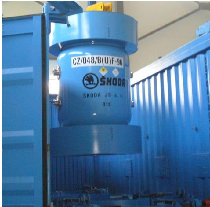
Figure 12. SKODA VPVR/M Cask (Type B) Loading into 20-FT ISO Container