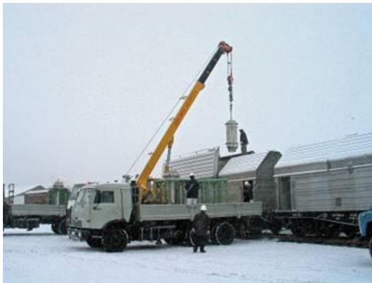
Figure 5 – TUK-19 Spent Fuel Casks loading into a TUK-5 Rail Car (Riga, Latvia)