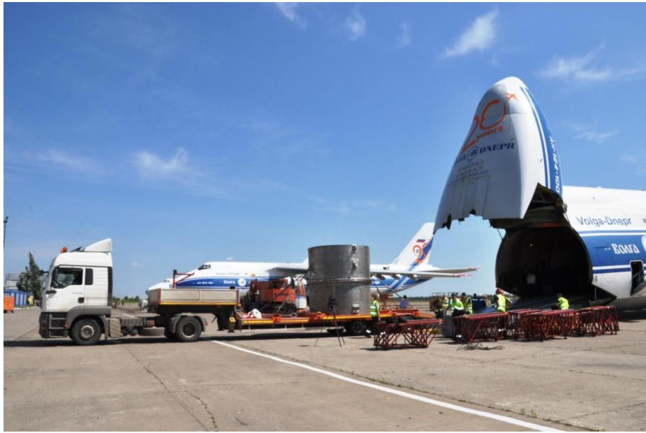
Figure 8 – TUK-145/C on Low-Boy truck/trailer loading into AN-124-100