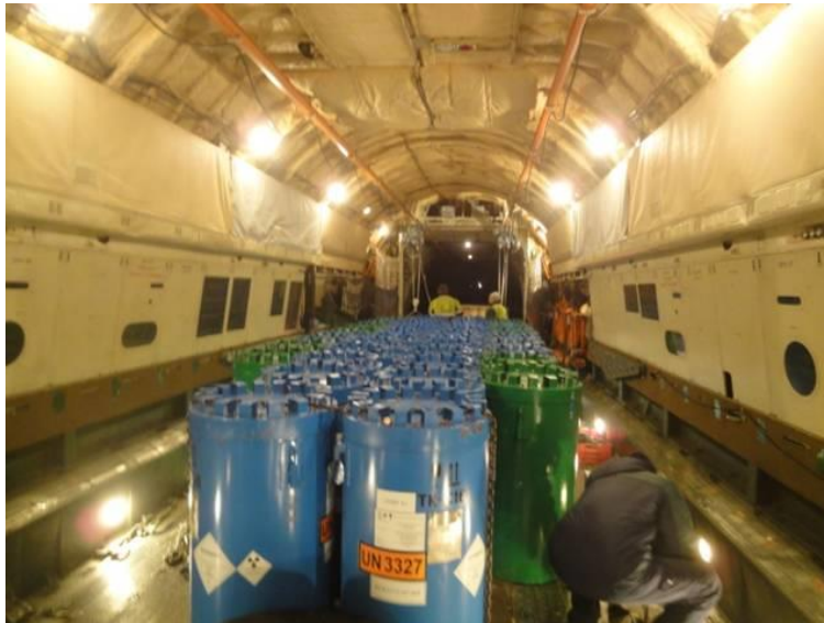
Figure 10. TK-S16 Packaging in IL-76 (Kharkiv, Ukraine)