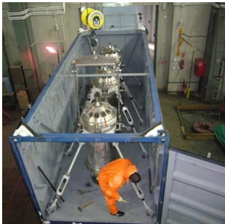
Figure 11. TUK-19 Spent Nuclear Fuel Casks in 20-FT ISO Containers