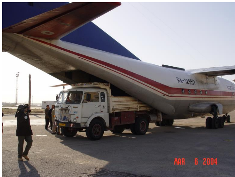
Figure 3 – HEU Fresh Fuel Loading (Tripoli, Libya) - AN-12