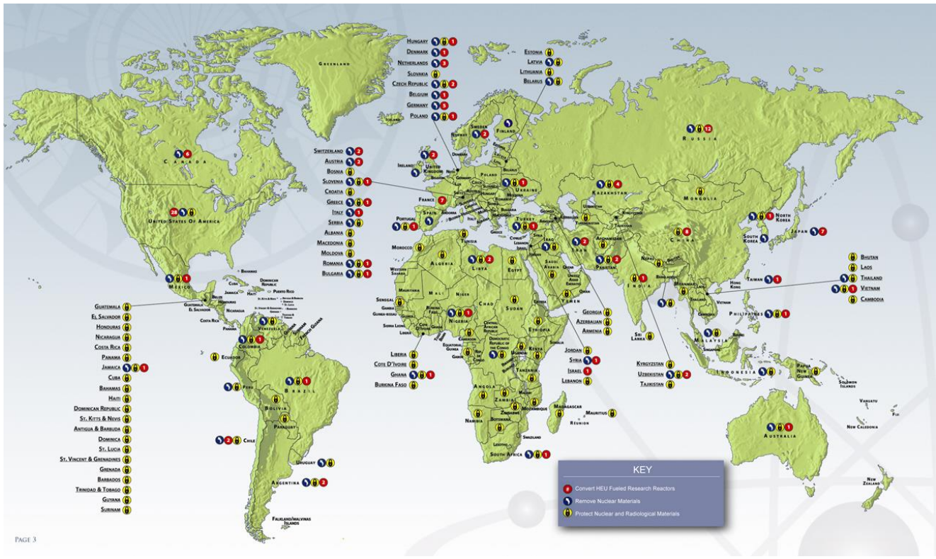
Figure 2 – US Foreign Fuel Locations and US Receiving Facilities for Spent Fuel Shipments