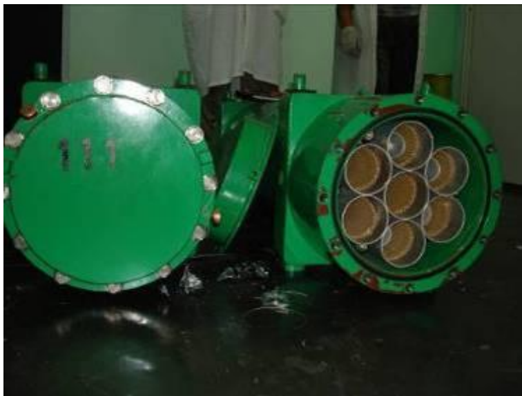
Figure 9. TK-S15 Packaging