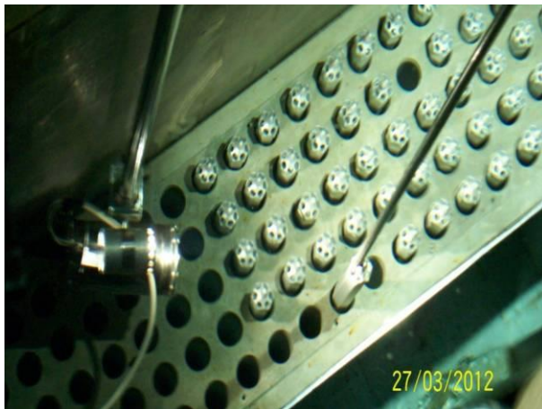
a – HEU SFAs in the storage pool

In 2007, low enriched uranium (LEU) assemblies were supplied to DNRI and non-irradiated VVR-M2 highly enriched uranium (HEU) fuel assemblies were removed from DNRI to the Russian Federation for reprocessing within the framework of the RRRFR Program. Then the DNRI specialists started gradual replacement of the HEU VVR-M2 for LEU fuel assemblies in the reactor core. In October, 2011, 106 irradiated HEU fuel assemblies were reloaded from the reactor pool into the spent fuel storage pool.