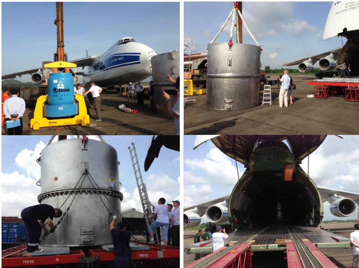
Fig. 10. Building up the TUK-145/C package and loading it into the aircraft

On July 1, 2013, an AN-124-100 aircraft delivered the energy absorbing container to Bien Hoa Airport. The handling equipment was deployed on the ground at the aircraft, and the SKODA VPVR/M cask and the energy absorbing container were joined together to build up the TUK-145/C package. The TUK-145/C package was pulled into the aircraft with a winch, and the handling equipment was put into the ISO containers.