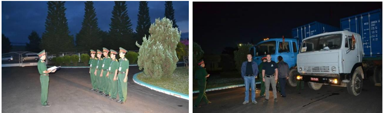
Fig. 9. Delivering the equipment from Dalat to Bien Hoa Airport

On June 30, 2013, 4 ISO containers with the equipment and tools started in the vehicle convoy from Dalat to Bien Hoa Airport. On July 1, 2013, an ISO container with the SKODA VPVR/M package was convoyed from Dalat to Bien Hoa Airport too. The convoy was escorted by the police and the military.