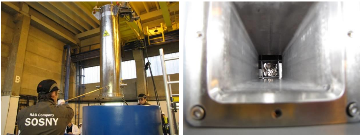
Fig. 5. Compatibility tests of VVR-M2 loading equipment and SKODA VPVR/M cask

The transfer cask with the load unit was installed on the adaptor with its plug having been removed, and the load unit was put into the SKODA VPVR/M cask basket using an electric winch. After removing the transfer cask, the plug was remotely installed in the adapter cell with a hook rod.