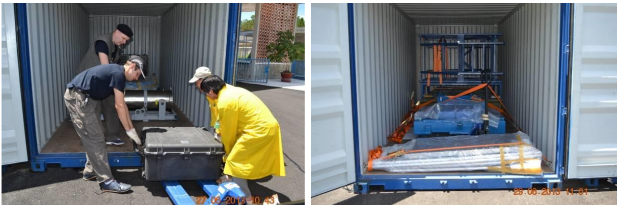
Fig. 8. Packing the equipment and loading into ISO containers.

Then the equipment was packed, loaded into the ISO containers and prepared for shipment to UJV, Rez a.s.