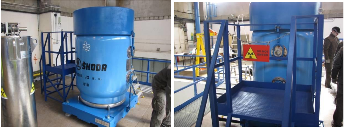
Fig. 4. Equipment installation at UJV

Then the equipment was packed and delivered to UJV, Rez a.s., the Czech Republic, by road. Once installed at UJV, the VVR-M2 loading equipment was tested for compatibility with the SKODA VPVR/M cask. During the tests a support plate with an adaptor and positioners were installed onto the SKODA VPVR/M cask; the load units were transferred from the dry storage pool in the SKODA basket using a transfer cask.