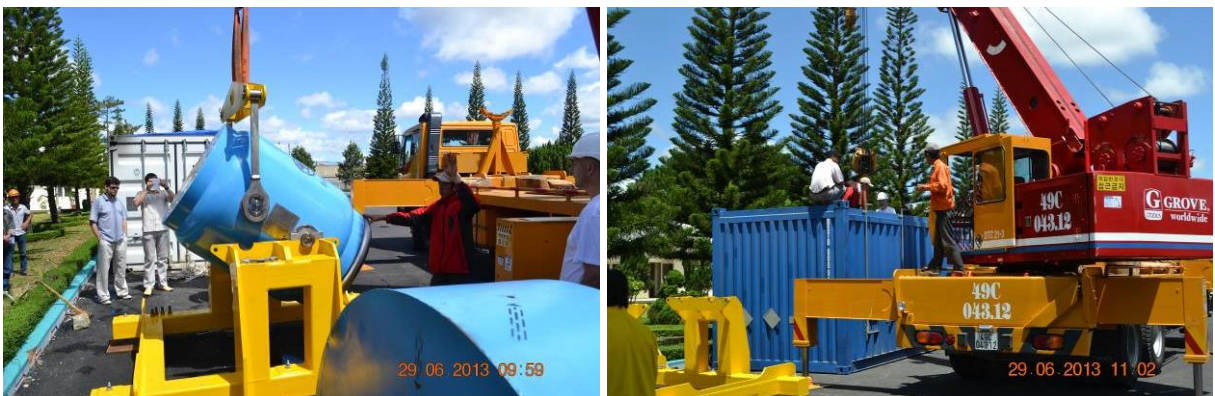
Fig. 7. Installing the SKODA VPVR/M cask in the tilter, loading into ISO container

The forklift moved the dried SKODA VPVR/M cask containing 106 VVR-M2 spent fuel assemblies out of the reactor hall and placed it near the tilter. A truck crane installed the cask in the tilter to put on the lower shock absorber. After that, the SKODA cask was transferred into a special ISO container, where the upper shock absorber was put on it; then, the cask was tied down.