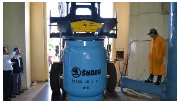
b – delivering SKODAVPVR/M cask to the reactor hall