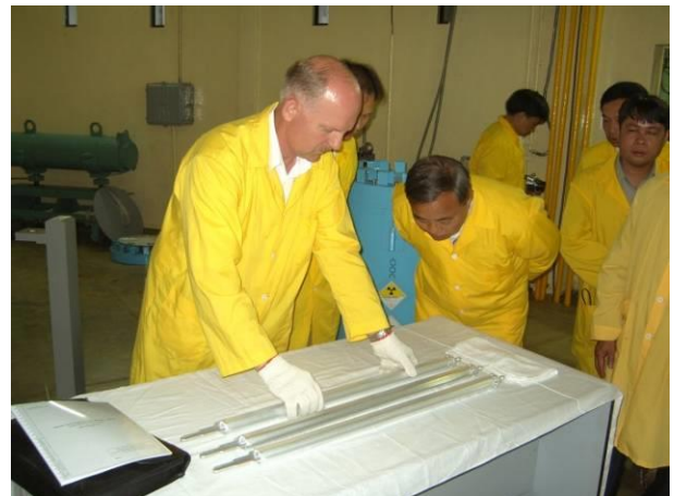
b – LEU VVR-M2 FAs