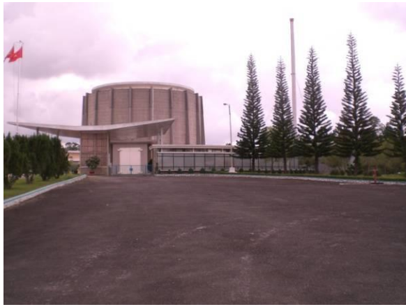
a – outside view