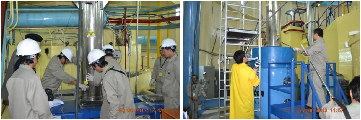
Fig. 6. Practicing in loading VVR-M2 SFAs into the shipping cask

the cask was evacuated, and a leak test was performed. The IAEA Safeguards experts supervised all the operations.