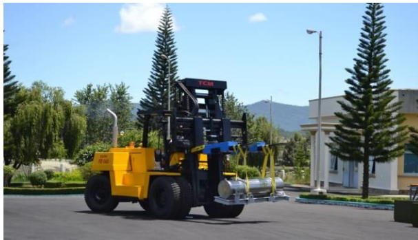
a – unloading the equipment

by sea in ISO containers. A horizontal ground was prepared for handling them there. A 16-ton capacity forklift was procured to deliver the SKODA VPVR/M cask to the reactor hall.