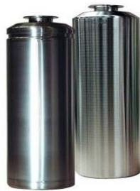
Figure 1: universal canister