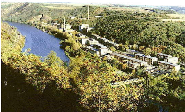
Figure 1. Nuclear Research Institute, Řež.

In February 2003, a team of technical representatives from the United States, Russian Federation, and the IAEA conducted a fact-finding mission of the Nuclear Research Institute (NRI) in Řež, Czech Republic, which is about 20 km north of Prague along the banks of the Vltava River (see Figure 1). The purpose of this mission was to discuss the RRRFR Program with NRI and to obtain preliminary information about the physical and mechanical state of their fresh and HEU SNF, their facilities, and their transportation capabilities and experiences. During this mission, NRI expressed a desire to participate in the RRRFR Program.