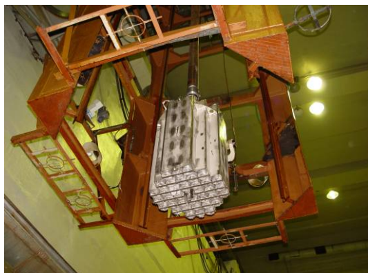
Figure 10. Loaded VPVR/M cask basket being transferred into the Building 101A hot shop/pool area.

Building 101A is a larger hot shop with remote operations capabilities for handling casks and SNF