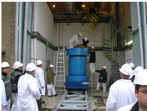
Figure 7. Cask transfer device on rails into the High-Level Waste Storage Facility entrance hall.

An extension was built onto the front of the HLWSF for handling and storing the transport casks. A cask transfer device on rails was installed in this extension (see Figure 7). A specially designed cask storage vault, used for storing both the loaded and empty VPVR/M casks, was installed on one side of the extension. This vault is designed to protect, isolate, and provide physical protection for the casks during storage at NRI (see Figure 8).