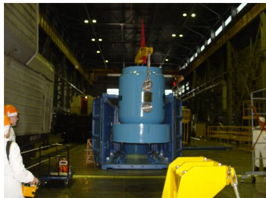
Figure 9. Cask unloading from the International Shipping Organization container in Building 855.

Upon arrival at Mayak, the ISO containers, loaded with VPVR/M casks, are received by rail in Building 855, a large rail/truck high-bay area with a heavy capacity overhead crane (see Figure 9). This building was equipped with interim storage for the ISO container; a 32-ton handling beam and slings for lifting and handling the ISO container; a handling beam to remove the cask shock absorbers; the cask manipulation frame; guiding rods to remove/install the shock absorbers; and scaffolding for both the ISO containers and VPVR/M cask. Specialized tools provided included a hand hoist with weighting equipment, pneumatic torque wrench, polymeric protector for the lid sealing surfaces, guide rods to remove the secondary lid, support for the secondary lid, and numerous wrenches.