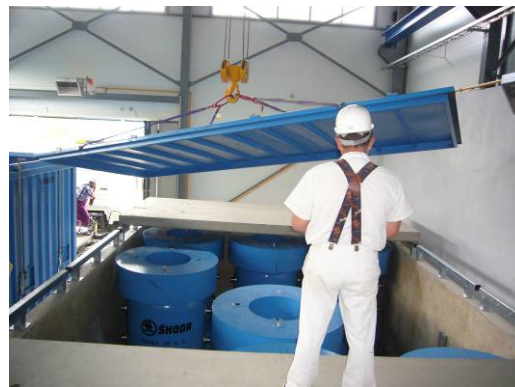
Figure 8. High-Level Waste Storage Facility extension cask storage vault.

Every NRI operation, procedure, new piece of equipment, and facility modification required special analysis and documentation. Examples of the documentation include (1) operational manual, (2) operation condition/limitation plan, (3) quality assurance manual, (4) emergency plan, (5) hot cell inspection and test plan, (6) permission for hot cell construction, (7) list of equipment to be controlled by SONS, (8) decommissioning plan, (9) list of controlled actions, (10) cask and SNF-handling operations procedures, and (11) safeguards and security plan, including the IAEA design information questionnaire. Many of these documents were provided to SONS (i.e., the Czech regulator) for obtaining facilities and operations licenses.