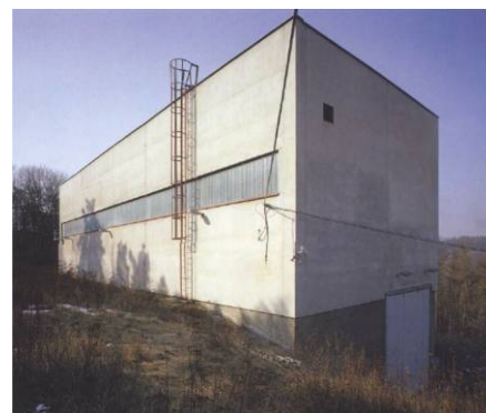
Figure 6. The High-Level Waste Storage Facility.

The HLWSF (see Figure 6) is located on a hill overlooking the main NRI complex. Preparing the HLWSF for fuel and cask-handling operations involved upgrading the overhead crane (adding a nomadic load cell and speed controls),