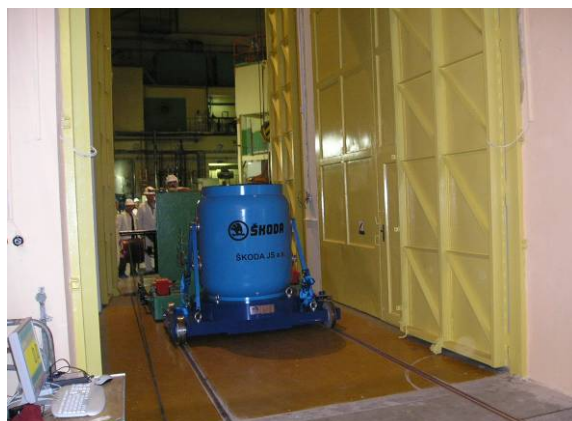
Figure 5. The VPVR/M cask being moved into the Reactor Annex Pool storage area.

Preparations for handling the fuel assemblies and cask in both storage pool areas involved overhead crane upgrades (adding a nomadic load cell and speed controls); setting up the ŠKODA VPVR/M cask manipulation frame; installing specially designed cask basket support in the RAP; modifying the AFR pool cask transport device; adding special shielding around the cask pool, support/fuel loading stand; setting up numerous specialized tools and equipment for handling the fuel and transport cask; and setting up cask drying and leak tightness testing equipment. NRI also modified their ŠKODA 1 × IRTM transfer cask needed to transfer two damaged SNF assemblies from the reactor building to the HLWSF.