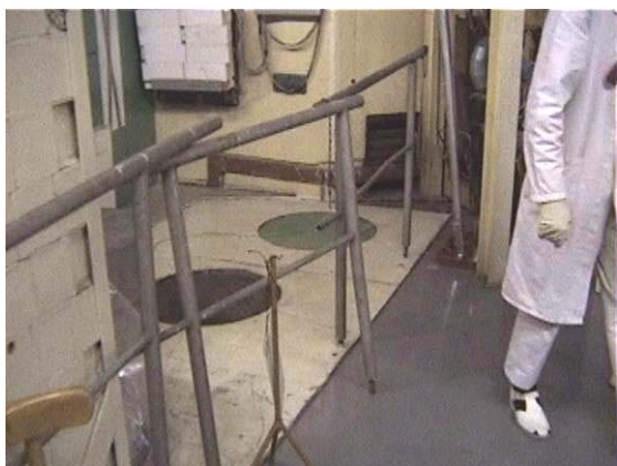
Figure 4. LVR-15 reactor At Reactor Pool for spent nuclear fuel storage.

The ARP and RAP are both located within the research reactor building. The ARP is connected to the research reactor vessel inside the main reactor building (see Figure 4), whereas the RAP is located in a room connected to the main reactor building, which is accessible by a special rail system (see Figure 5).