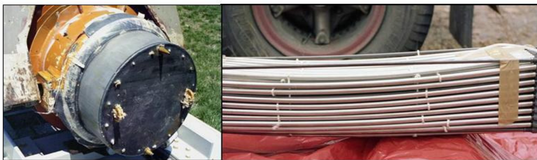
Fig. 3. (a) The closure end of the 20.5 t cask with the impact limiter removed after the 9 m end-on impact; (b) the NS Savannah fuel assembly following the 9 m slapdown impact test.