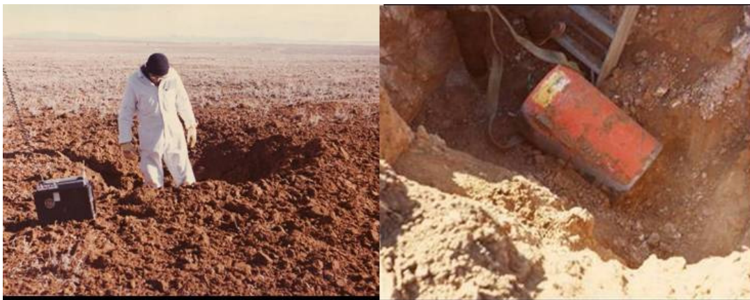
Fig. 4. BE-83 cask (a) completely buried as the result of 610 m drop from helicopter onto hardpan desert soil; (b) after excavation.

The BE-83 cask design that was tested for the 9 m regulatory drop described above was first tested. During the drop test, the cylindrical axis of the BE-83 cask rotated from the vertical by approximately 100° during the 610 m descent, resulting in a near side-on impact with the closure end slightly lower. The impact velocity was 110 m/s. Figure 4(a) shows the hole in the desert after impact before excavation; the case was completely buried to a depth of 2.44 m during the impact. Figure 4(b) shows the cask after it was excavated. No significant deformation was observed. The lifting lugs were sheared off as a result of the combined impact and recovery effects. No observable lead slump was observed.