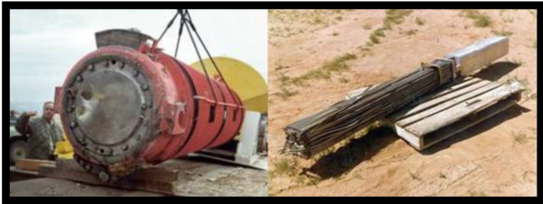
Fig. 8. The 20.5 t cask (a) head end after 135 km/hr impact; (b) condition of fuel assembly with ballast after the 135 km/hr impact.

Grade crossing impact test of 109 t rail locomotive into the 22.7 t truck-mounted cask: An obsolete 22.7 t cask was impacted by a locomotive traveling at 130 km/hr. Figure 9(a) shows the locomotive and truck cask and trailer during impact at 130 km/hr. Figure 9(b) shows the resulting damage to the full scale cask. Leak testing of the cask after impact indicated a small leak in the head seal, when the cask was pressurized. However, it was determined that, had the cask contained cooling water as it was originally designed to do, this leakage would have caused essentially no risk to the public. The cask head was removed without difficulty and the fuel was found to be intact with only slight bowing.