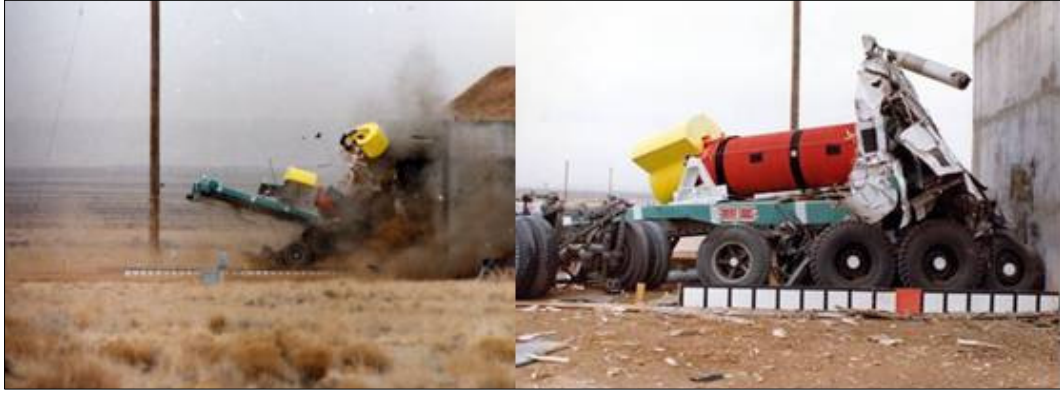
Fig. 7. 20.5 t SNF cask and transport system (a) during impact of at 135 km/hr; (b) following impact.