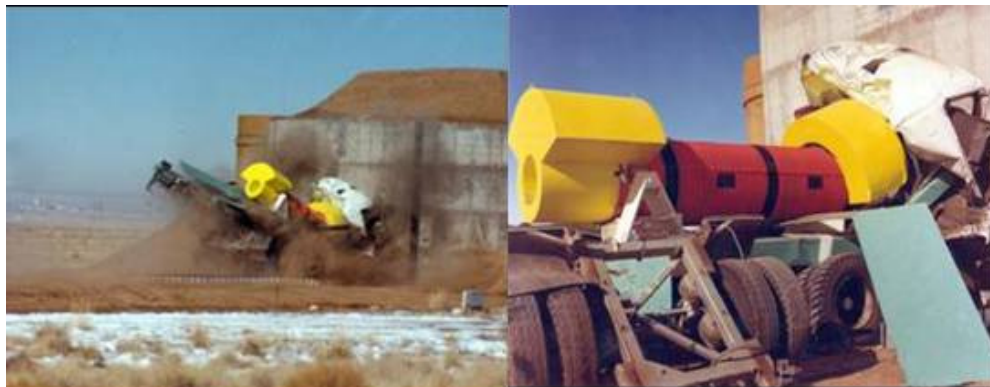
Fig. 6. 20.5 t SNF cask/transport system (a) during impact of at 100 km/hr; and (b) following impact.

Figure 6(a) shows the cask and transport system during the 100 km/hr test; and Figure 6(b) shows the cask and transport system following the impact. As predicted by the pretest analyses, the tractor was completely destroyed in the crash. Although the cask tie-downs did not break loose during impact, posttest inspection of the debris indicated that the cask tie-downs had been close to failure. The cask remained intact, sustaining only superficial damage to the external surface. The cask head was easily removed, and the fuel assembly was found to be intact and undamaged.