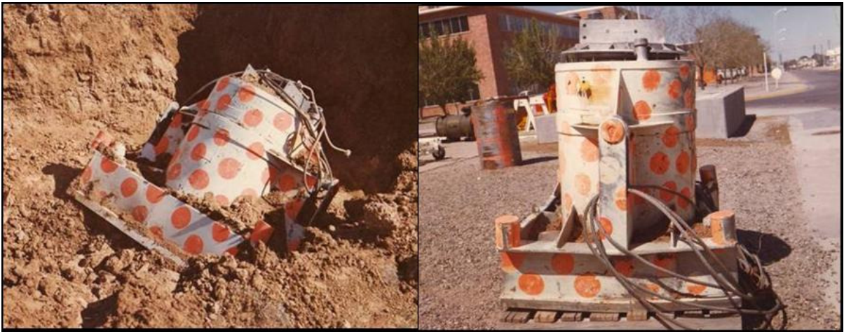
Fig. 5. OD-1 cask (a) during excavation after 610 m drop from helicopter onto hardpan desert soil; (b) after excavation.

An obsolete Oak Ridge Research Reactor OD-1 Spent Fuel Carrier, which was originally approved by DOT under Special Permit No. 5660 to ship ORR-type irradiated fuel elements, was a stainless steel clad, lead shielded upright cylindrical container with square base weighing 7410 kg. It was also dropped from a helicopter under the same conditions as the BE-83 cask. The orientation of the cask was vertical at release from the helicopter, but it rotated approximately 30° during its descent from 610 m. The tie-down (square) plate was the first part of the cask to contact the ground. The cask was buried to a depth of 1.28 m into the earth, and the impact velocity was 103 m/s. The partially excavated cask is shown in Figure 5(a); the fully excavated cask is shown in Fig. 5(b). The tie-down plate was deformed, with its superstructure crushed at the point of impact. The lead shielding inside of the outer shell slumped approximately 20 mm with respect to the outer shell. The cask displayed slight bulging at a point 15 percent of the length above its base. The closure bolts, located in ring on the top, were all canted inward, which made the closure plug difficult to remove. Measurements of the inner cavity indicated a reduction of about 1 mm in its diameter. The inner basket was not visibly damaged, but it was difficult to remove because of the inner cavity distortion.