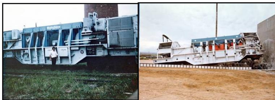
Fig. 10. Special railcar/cask system (a) prior to testing; and (b) after 130 km/hr impact test.

The full scale test was conducted at a velocity of approximately 130 km/hr. Figure 10(a) shows the railcar and cask before impact, with the array of rockets that were used to propel the system to the impact speed. Figure 10(b) shows the railcar and cask after impact. The impact resulted in extensive damage to the railcar structure but the damage to the target was minimal and target deflection was negligible. The cask body was un-deformed except for minor deformations to the external cooling fins. There was no leakage. Subsequent examination of the fuel assembly indicated that the fuel pins were undamaged. Only the support bracket at the end of the bundle was slightly distorted.