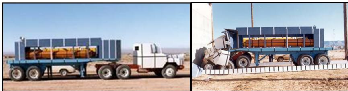
Figure 11. PNC SNM transport system (a) before 93 km/hr impact test; and (b) after 93 km/hr impact test.

in recovery of packages after such accidents would not be exposed to any radiation of significance.