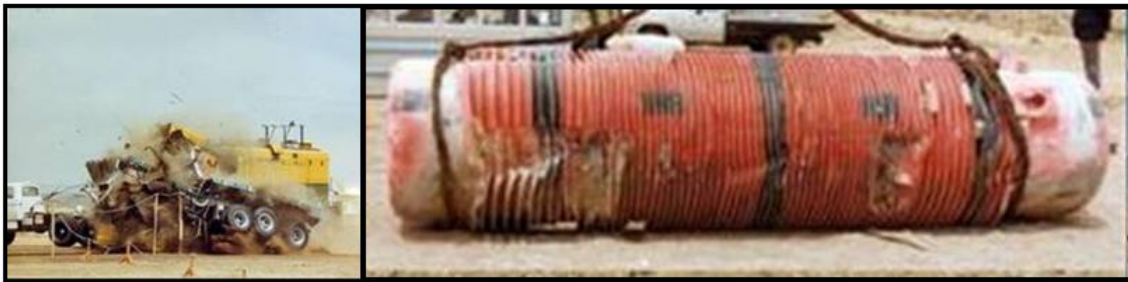
Fig. 9. Locomotive (a) impacting the truck cask and trailer at 130 km/hr grade crossing test; and (b) post test damage to the cask.

Grade crossing impact test of 109 t rail locomotive into the 22.7 t truck-mounted cask: An obsolete 22.7 t cask was impacted by a locomotive traveling at 130 km/hr. Figure 9(a) shows the locomotive and truck cask and trailer during impact at 130 km/hr. Figure 9(b) shows the resulting damage to the full scale cask. Leak testing of the cask after impact indicated a small leak in the head seal, when the cask was pressurized. However, it was determined that, had the cask contained cooling water as it was originally designed to do, this leakage would have caused essentially no risk to the public. The cask head was removed without difficulty and the fuel was found to be intact with only slight bowing.