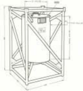
Fig.2. FS05 Cask

Volume reduction (about 50%) is also possible cutting off casks. It has been realized on specific casks, figure 2 and photo 3.