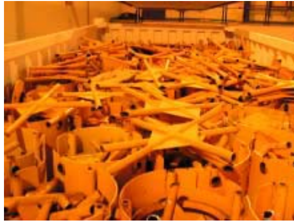
Photo 3. Cut off FS05 in ISO 20' container