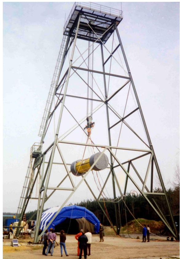
Fig. 1. 9 m drop with the POLLUX cask

The remarkable distribution of ductile cast iron as material for Type B packages can be surely put down to the evolution of the casting technology and the improvement on the safety relevant material properties especially at thick-walled castings. On the whole the material quality at the serial production of casks has improved considerably since the publication of the first safety concept [5]. Particularly