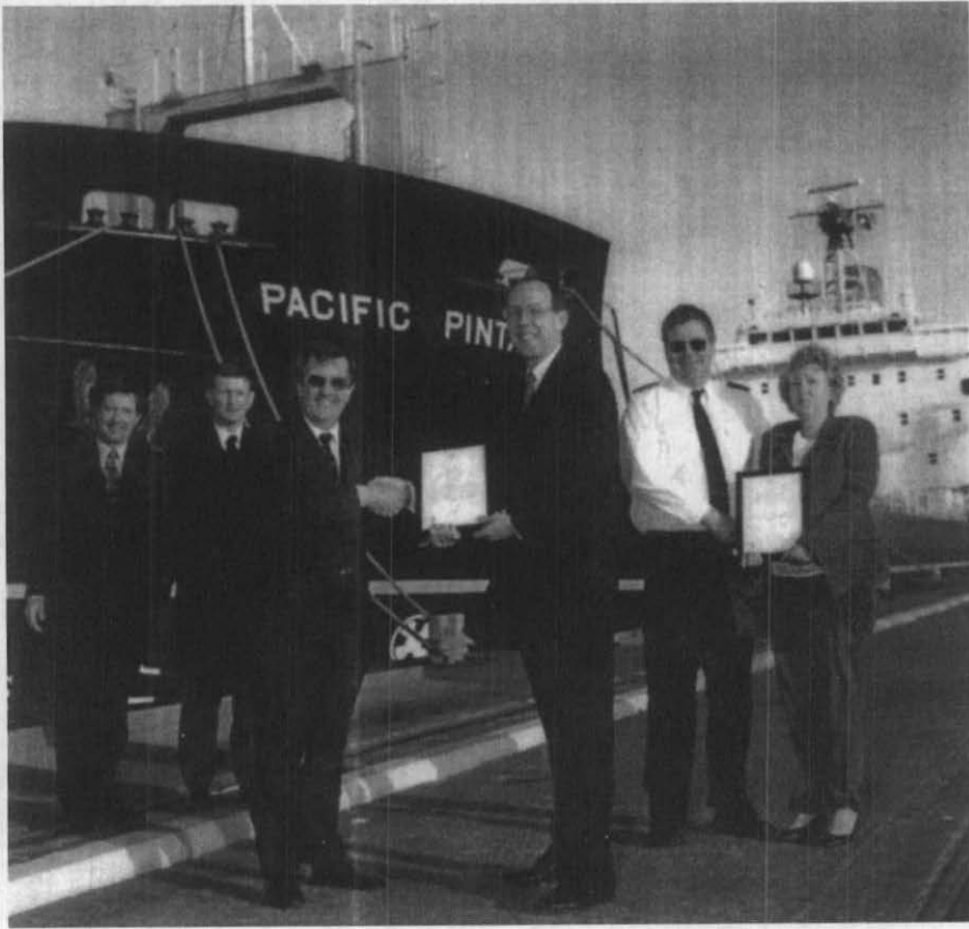
Figure 1: Presentation of the ISO 14001 Certificates at Barrow Marine Terminal