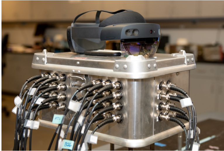
Figure 2. Picture of the Microsoft HoloLens 2 set on top of the H2DPI detector system. The HoloLens is a stand-alone battery powered computer system that can project holograms into a user’s field of view. The holographic objects can be interacted with, and the physical world may impact holographs - this is also referred to as a mixed reality environment [3].

a measure of intensities in the spherical space around the detector, with the highest intensity being in the angular direction where most radiation is being detected from.