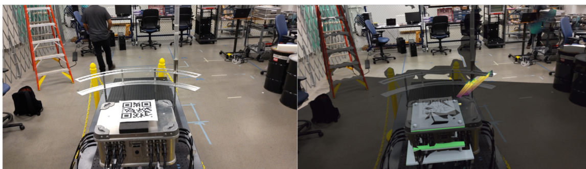
Figure 4. Left: Screenshot from the HoloLens showing the user’s field of view without any holograms. The H2DPI is in view in front of the user, with a ^{252}\text{Cf} source set in front of the system. Right: Screenshot from the HoloLens showing the user’s field of view with the mixed reality application running. The user is shown the intersection of the radiation image with the 3D mesh of the surrounding space via colored rays. In this case, the rays point towards the ^{252}\text{Cf} source, i.e. the correct incidence direction of radiation has been shown to the user.