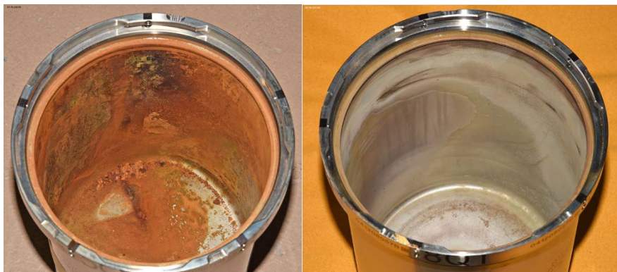
Figure 3. On the left, the SAVY-4000 that contained the SAI solution. This solution was in a plastic Erlenmeyer flask bagged out in polyethylene bag-out bag material. This solution was containerized for 14 months. On the right is the SAVY-4000 that contained “hatch” material

The worst cases of corrosion in SAVY-4000 containers were observed in solution assay instrument (SAI) calibration solutions (plutonium in 3M hydrochloric acid), MSE residue, and a “hatch” item. Hatch is high purity plutonium dioxide mixed with 7% Pu-238. The MSE residue, hatch and SAI items passed all surveillance testing. The SAI solution container showed large amounts of general corrosion, seen in Figure 3 . This corrosion product was easily wiped away with cleaning solution. The base surface showed that the laser-etched barcode and serial number were visible on the interior surface of the container. To evaluate whether the etching provides an area likely for corrosion, small samples of SAVY-4000 containers and Hagan containers underwent etching at different speeds, powers, and frequencies [9]. These samples were subjected to Iron (III) chloride to induce pitting in the samples. Based on the results, the etching did not play a role in pitting characteristics or rate.