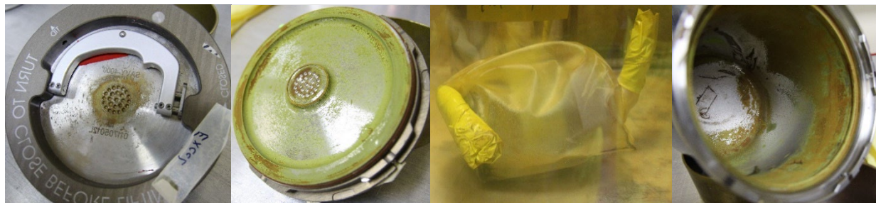
Figure 4. A SAVY-4000 discovered in a floor storage location during PF-4 walkdowns in late FY22. The external filter corrosion was identified and the material unpacked. From left to right – the external filter corrosion, the unpacked inner lid corrosion, the mostly pristine bag-out bag, and the inner body corrosion.

Annual surveillance will continue to occur providing data for both SAVY-4000 aging and Hagan aging. In FY22, a SAVY-4000 on a floor storage location was identified to have corrosion surrounding the filter as seen in Figure 4 . This item was unpacked, and the container passed all surveillance testing. This container has been removed from PF-4 for further study. The material within this container was a low wattage MSE residue. When unpacking, the bag-out bag material did not appear degraded. This suggests that the material itself was off gassing chloride gasses. The corrosion on the container was green, suggesting the formation of iron (II) chloride. This container has since turned rust colored, suggesting further oxidation after unpacking oxidized the container to iron (III) oxide. Additional studies of material off-gassing and the effect of relative humidity on gas generation and corrosion will also be conducted.