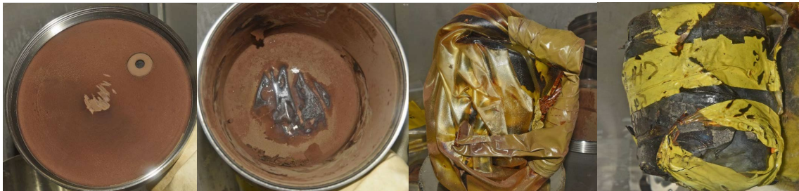
Figure 2. Heavily corroded Hagan container after 8.1 years. From left to right – the inside of the Hagan lid, the interior of the Hagan, the external second bag-out bag, the internal first bag-out bag.

In conjunction with accelerated aging studies, annual surveillance of both Hagan and SAVY-4000 provided in-situ evidence of aging conditions. Hagan containers are not a direct comparison as they are constructed out of 304L stainless steel but have been in service since 1999 and are another avenue to evaluate of potential degradation pathways of storage containers. In 2016, a Hagan was selected by engineering judgement due to the white powder collecting near the filter. When opened, the interior showed signs of corrosion, and the bag-out bag was heavily darkened and weakened, as shown in Figure 2 . The presence of corrosion presented a significant challenge to the ability to justify additional design life extensions for the SAVY-4000.