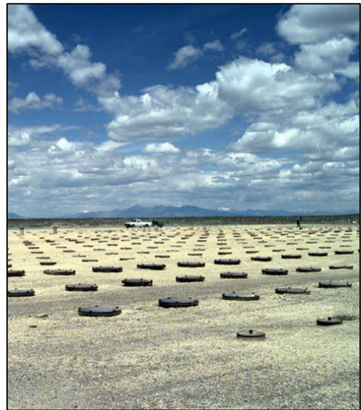
Figure 1: Radioactive Scrap and Waste Facility at Idaho National Laboratory

While extremely versatile, the silo storage system discussed in this paper has been optimized specifically for the storage of DSRS. The silo storage concept is simple and therefore economical to install and operate. The safety functions are passive and thus inherently safe. The design provides a high degree of safety to operating personnel, the public, and the environment. Silo storage is flexible and can be incorporated into a wide variety of environments.